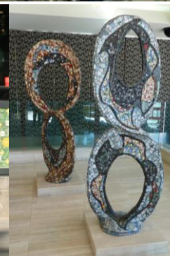
Infinity a9 Mina Shafer