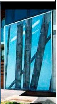
Tall Timber a12 MMS