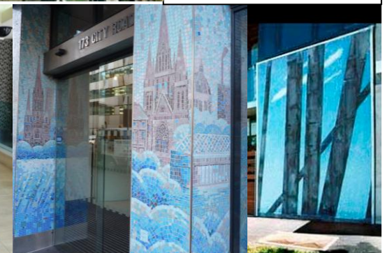
Southbank and City Towers a10&a11 Melbourne Mural Studio