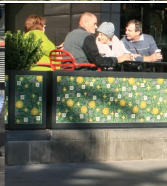
Cervo Café a8 outside panels by Red Design