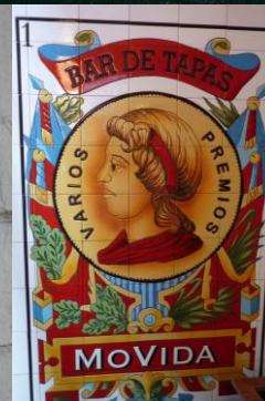
MoVida f9 Imported Spanish