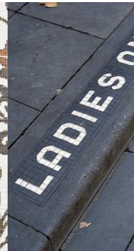
Ladies Only f12 Unknown