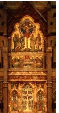
St Paul's Cathedral f13 Clayton & Bell UK