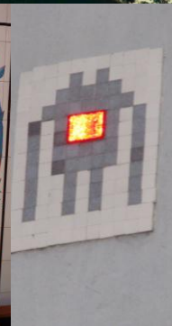
Space Invader f10 Invader